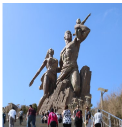
The African Renaissance Statue, Senegal.

About The African Cultural Exchange A US-based nonprofit organization founded in 1989. The ACE conducts cross-cultural, educational, developmental and healthcare projects throughout Africa. The organization supports projects in Senegal, The Gambia, Sierra Leone, Gabon, Zambia, Rwanda, and Kenya.